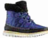
Snow boots, £77, Sorel (sorelfootwear.co.uk)

For more hotel reviews, see telegraph.co.uk/hotels