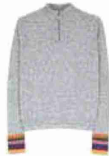
Merino-wool base layer, £120, Wyse (wyselondon.co.uk)